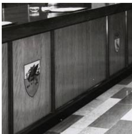
The beautifully designed counter