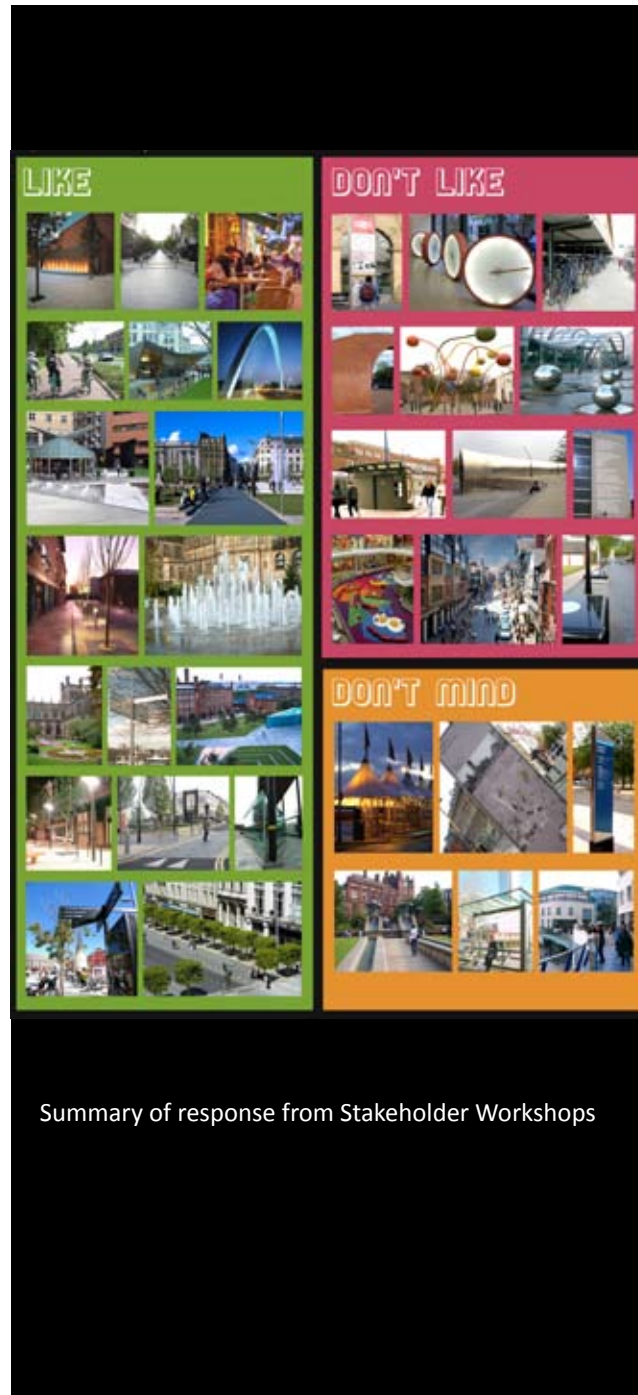
Summary of response from Stakeholder Workshops

It is interesting to note that a number of images disliked by the adult steering group, were liked by the children. Having said this, there were a number of similarities in their responses and these ideas and styles were taken forward into the development of the conceptual designs, as well as the public realm strategy as a whole.