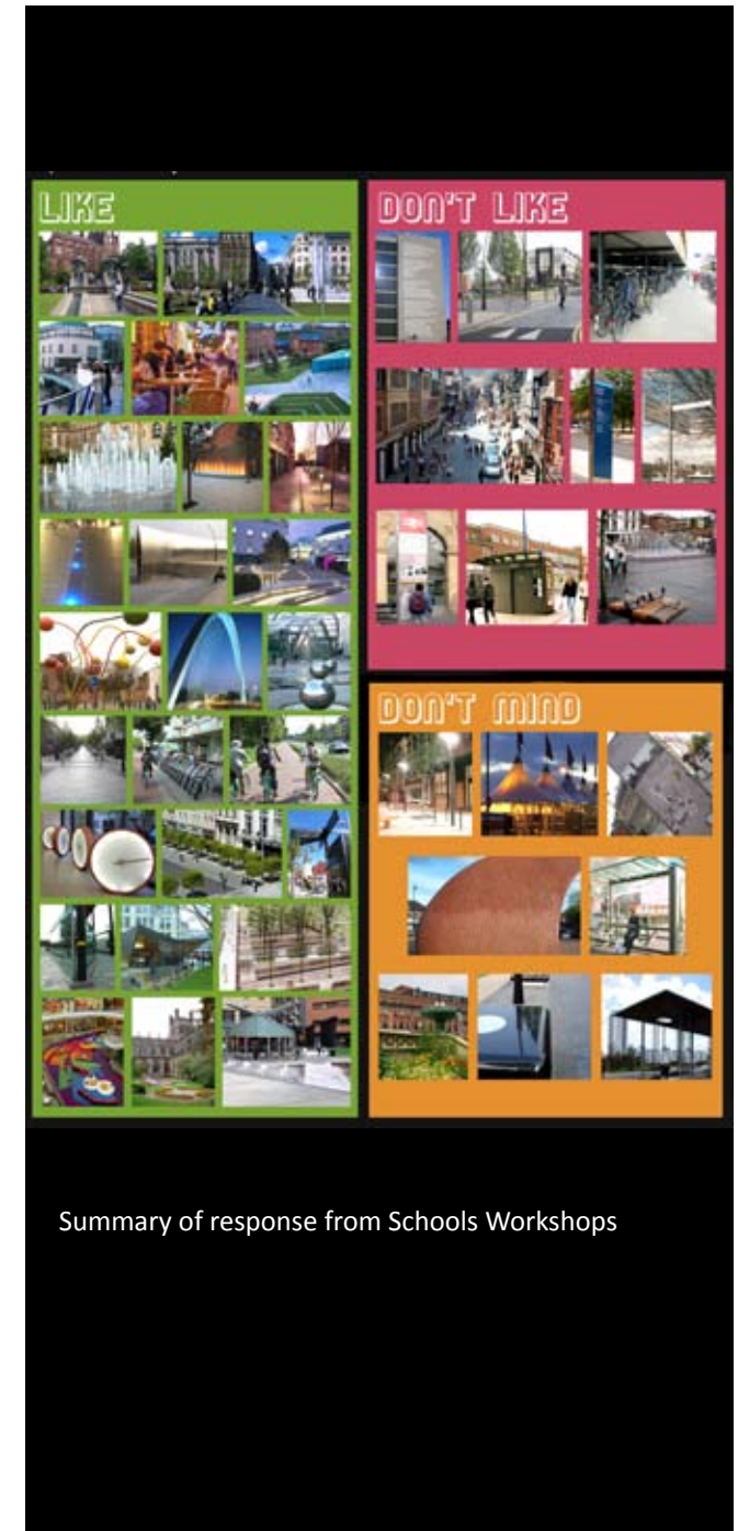
Summary of response from Schools Workshops