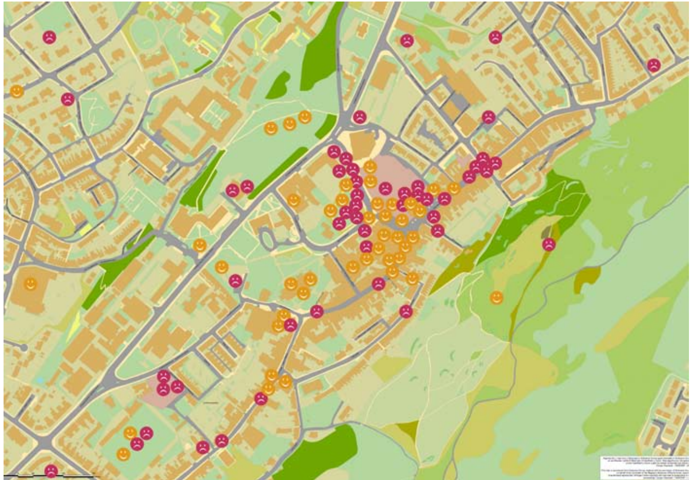
Fig 2 Feedback from the schools workshop of places liked and disliked